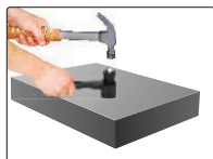
hammer impact to apply test force